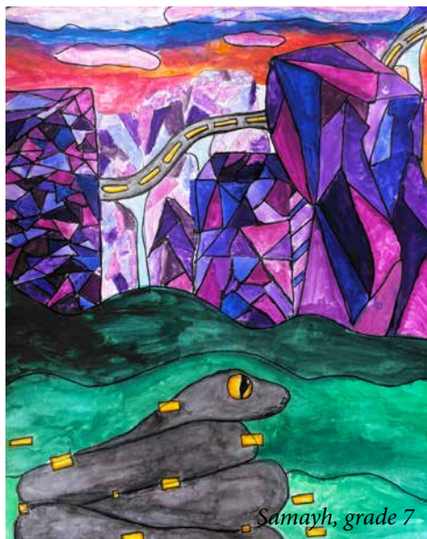
Samayh, grade 7