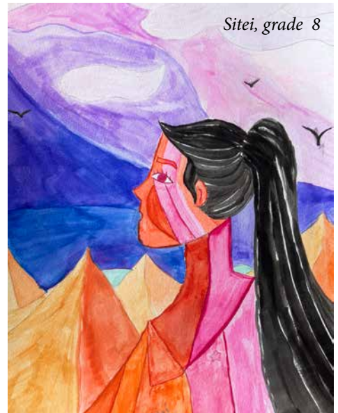
Sitei, grade 8