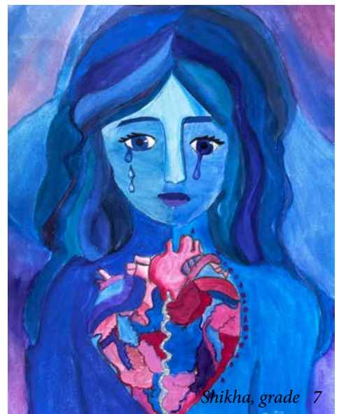
Shikha, grade 7