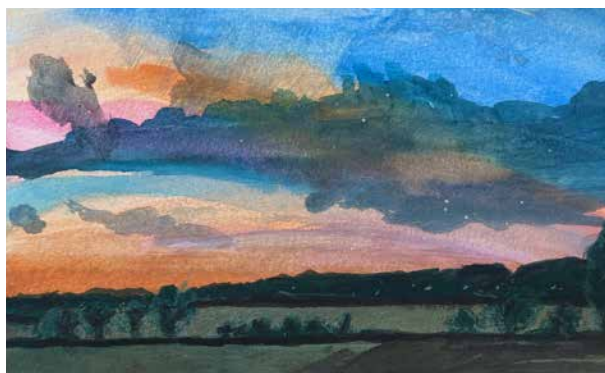
Jibu, grade 7