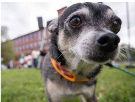
(taken during the 2024 'Best Pooch in the Noosk event)

All dog licenses must be renewed every year. Licensing helps ensure that dogs are properly vaccinated against rabies. Registering dogs and providing tags helps return lost dogs to their owners. Unlicensed lost dogs are commonly transported to animal shelters - avoid impounding and boarding fees!