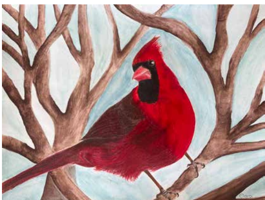
Clara, grade 7