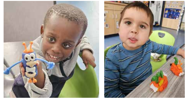
Students in the Narwhals class made play dough creatures and worked on learning and sequencing the letters of their names.

The Agency of Education established the statewide rate of $3982.00 per child for the 2024/2025 school year. This covers 10 hours per week of high-quality prekindergarten education for 35 weeks.