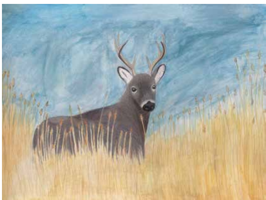
Greta, grade 7