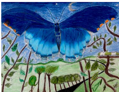
Pranav, grade 7