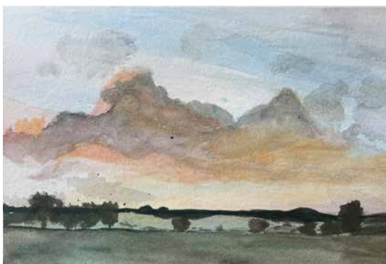
Ankita, grade 8

This unit was followed by exercises in landscape painting with watercolors; our young artists layering colors and manipulating them with water and brushstrokes to create a sense of depth and texture.