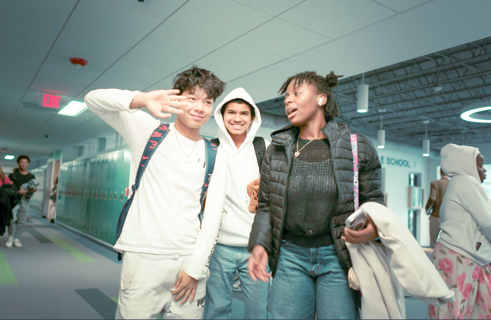
Passing period at the high school