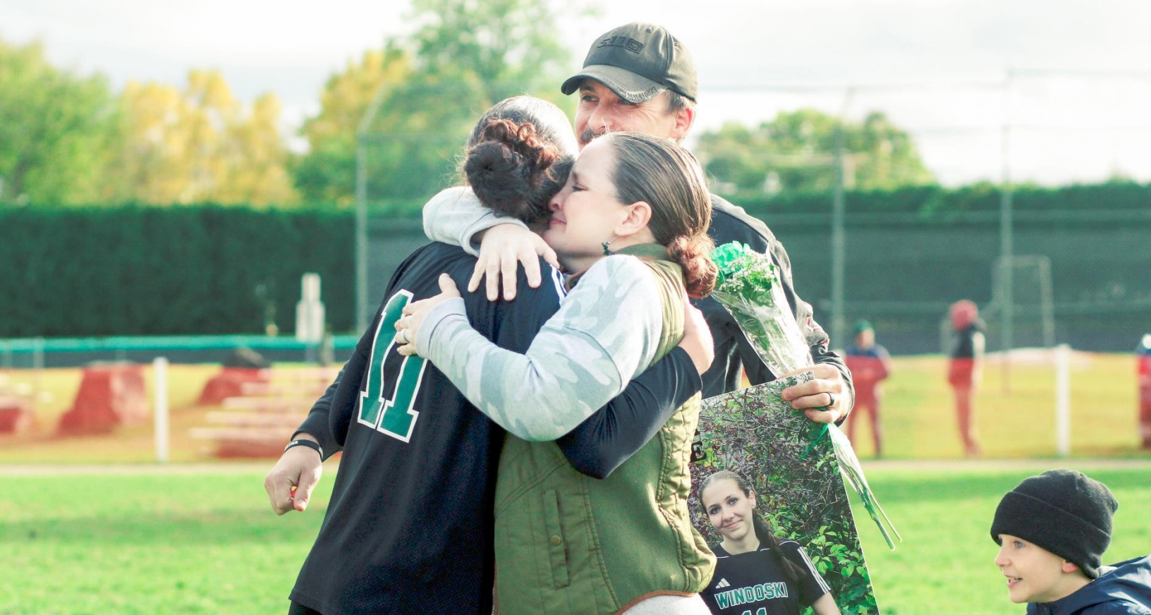
Proud parents show appreciation after the student athlete's last soccer game in high school.