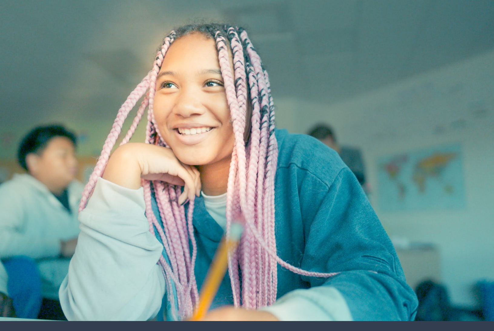
A middle school student engages in group work during a morning class.