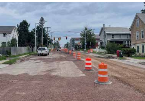
Crews install water and sewer systems on Main Street

To feature your small business or nonprofits reach out to Downtown Winooski at info@downtownwinooski.org .