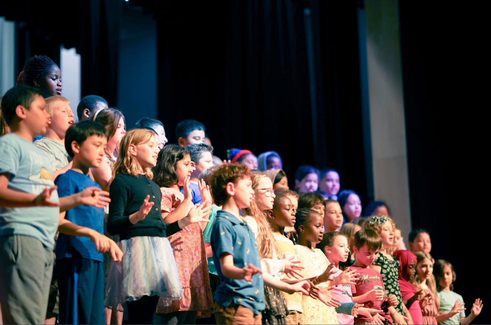
JFK Students showcase their singing talent during the JFK Spring Concert