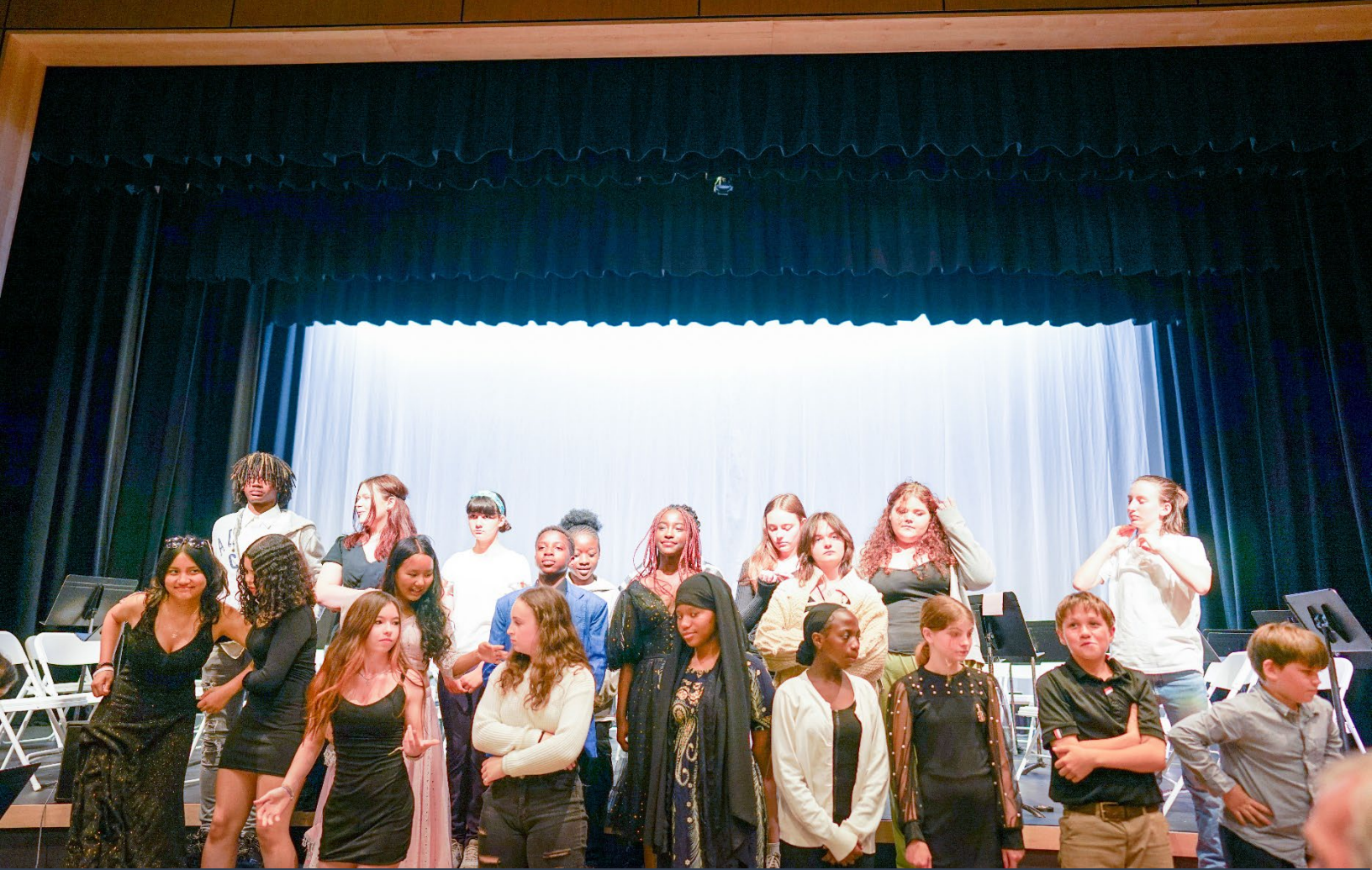
Middle and High School students singing in choir are always a crowd favorite