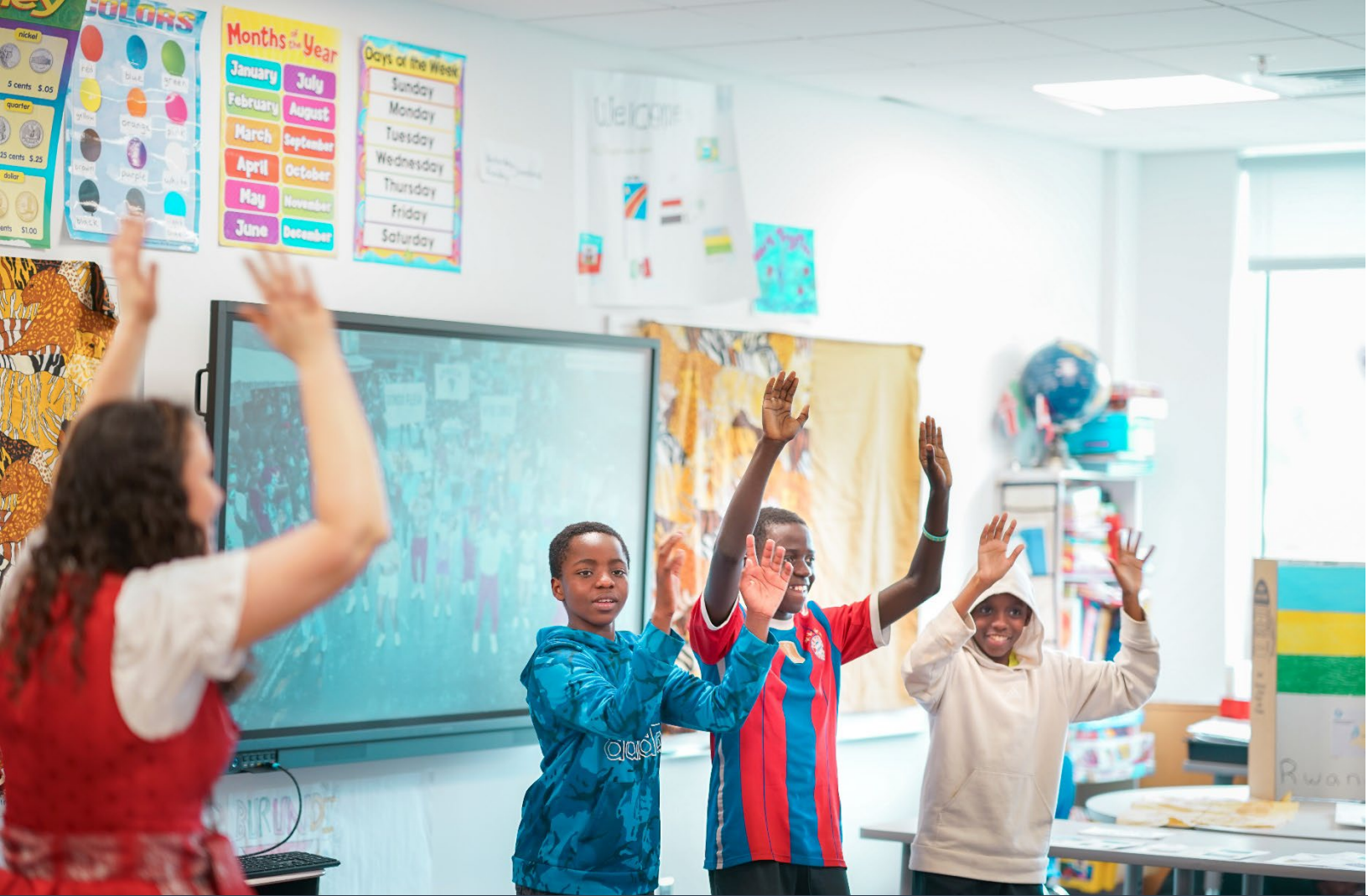
Middle School students teach the room how to properly dance during the Cultural Day organized by the Student Council