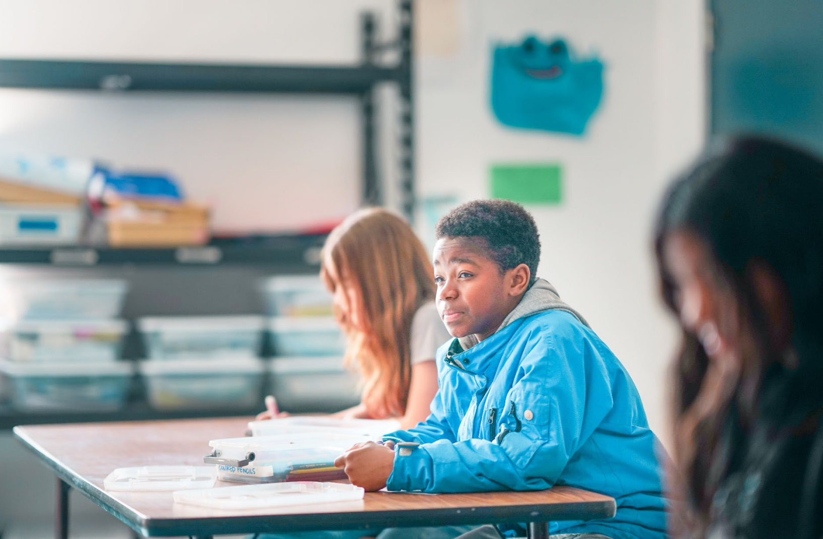
Student in the Winooski Middle School attentively listening to the teacher's question