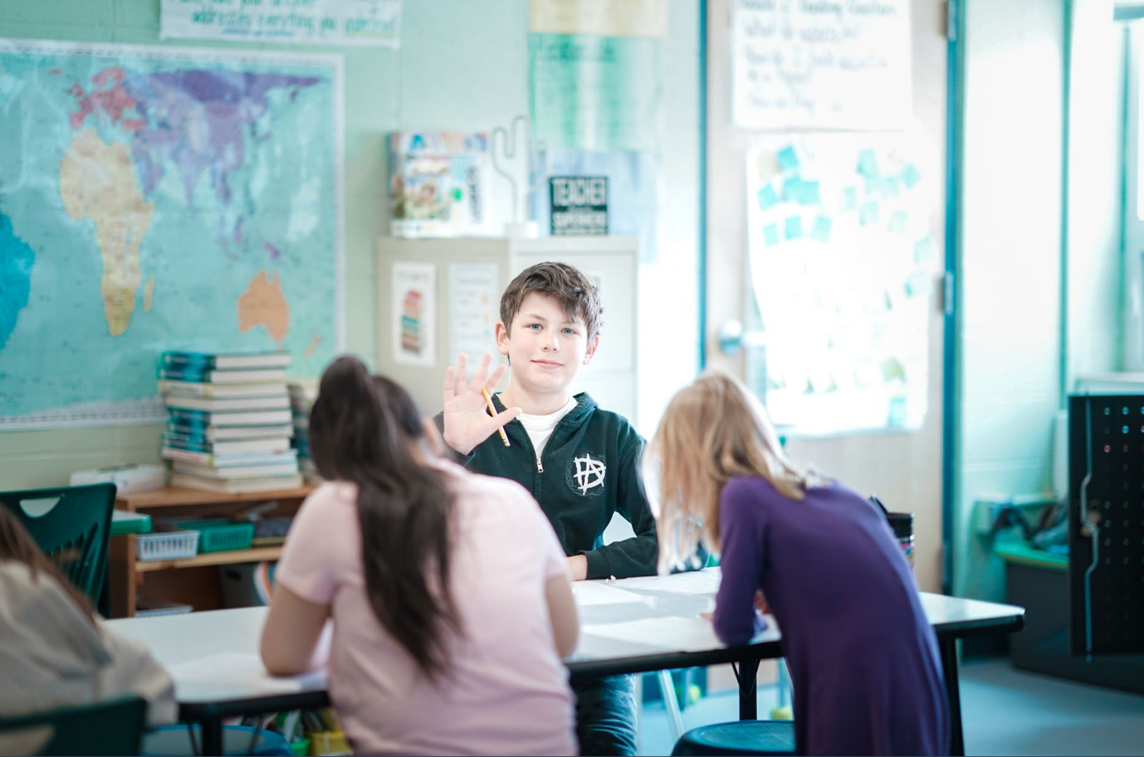
A student says hi while in class in the Winooski Middle School