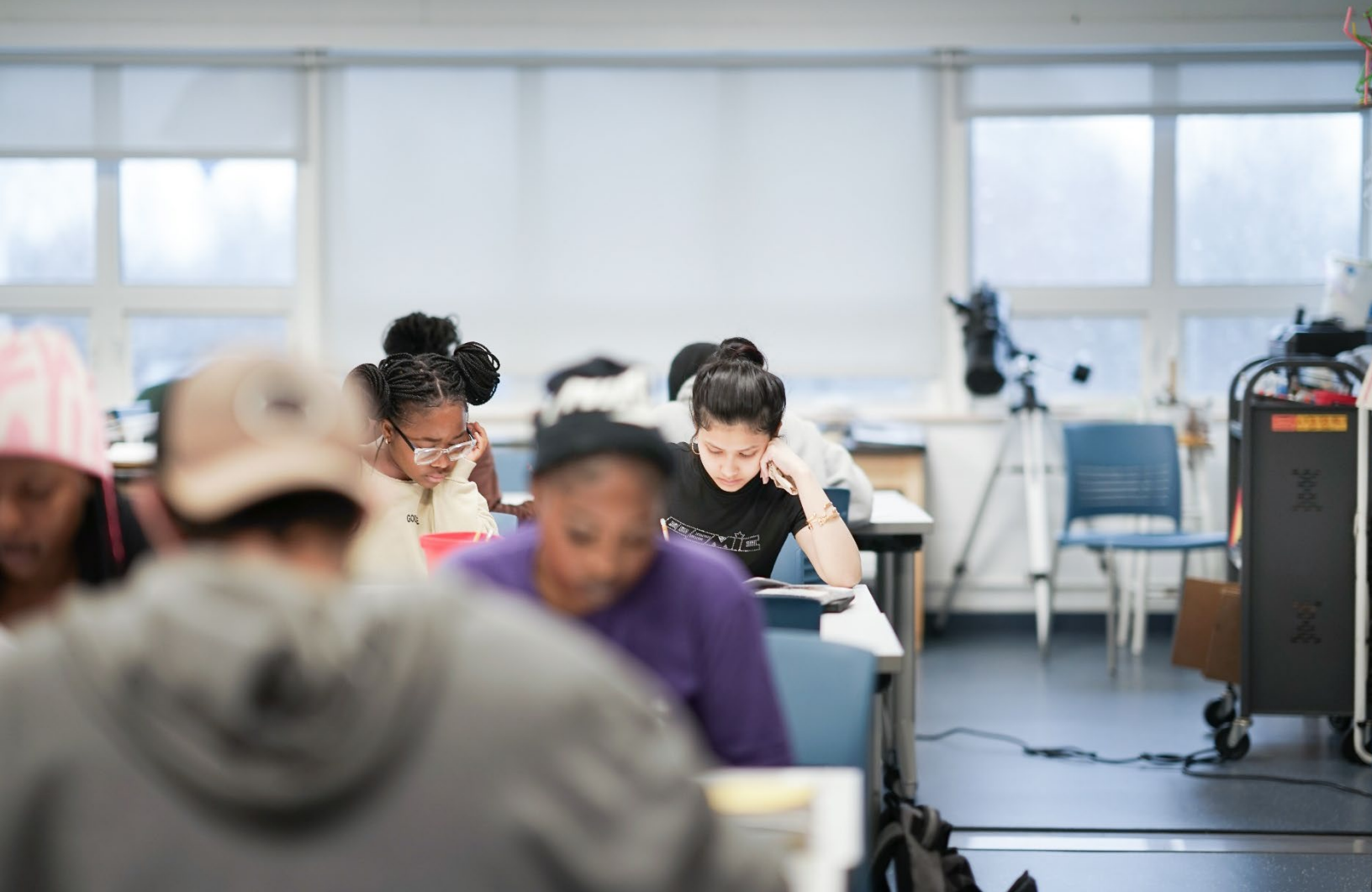
Students focused on a Social Studies task at the Winooski High School