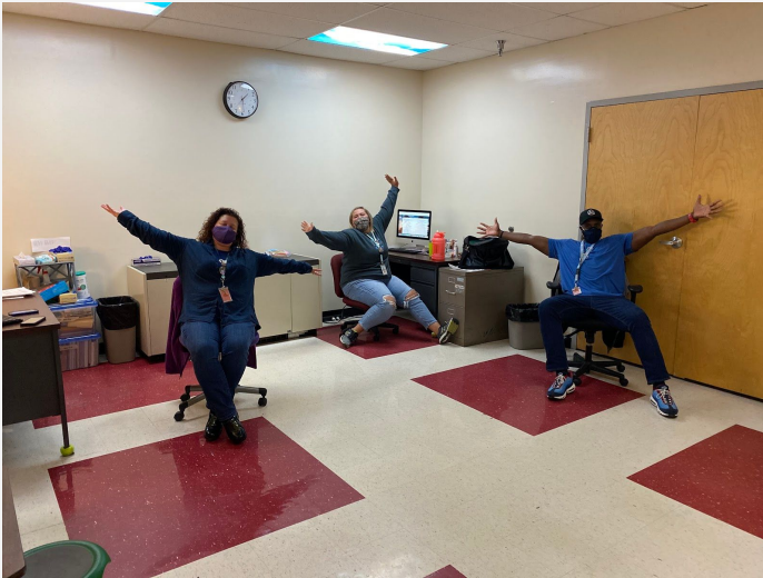
The Student Support Team (SSR)